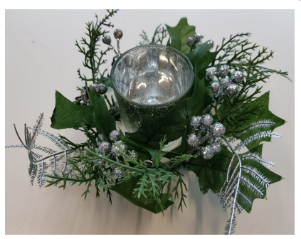
Green and silver candle holder