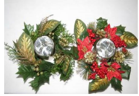
White and Green candle holder Red and Green candle holder