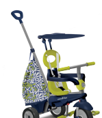
SmarTrike Groove Pink/Green