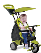
SmarTrike Glow Blue/Green/Pink/Red