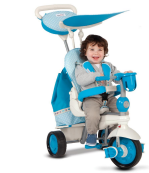
SmarTrike Sport Blue/Pink