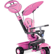
SmarTrike & Go