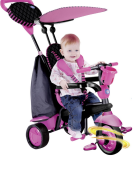
SmarTrike Spark Blue/Pink