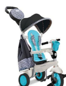
SmarTrike Deluxe Blue/Pink