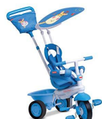
Fisher Price SmarTrike Elite Blue/Pink