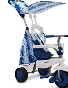
SmarTrike Splash Blue/Purple