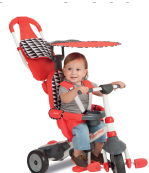
Fisher Price SmarTrike 4in1 Jungle Pink/Red