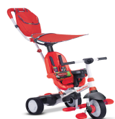
Fisher Price SmarTrike Charisma Red

BIG W takes product safety seriously and wishes to advise customers of a product recall on the following product: