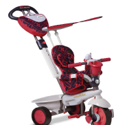
SmarTrike Dream 4in1 Red/Green