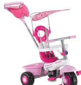
SmarTrike Fresh Pink/Yellow