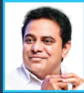
KT RAMA RAO

Hon'ble Minister for IT, MA&UD, Industries, Mines and NRI Affairs Government of Telangana