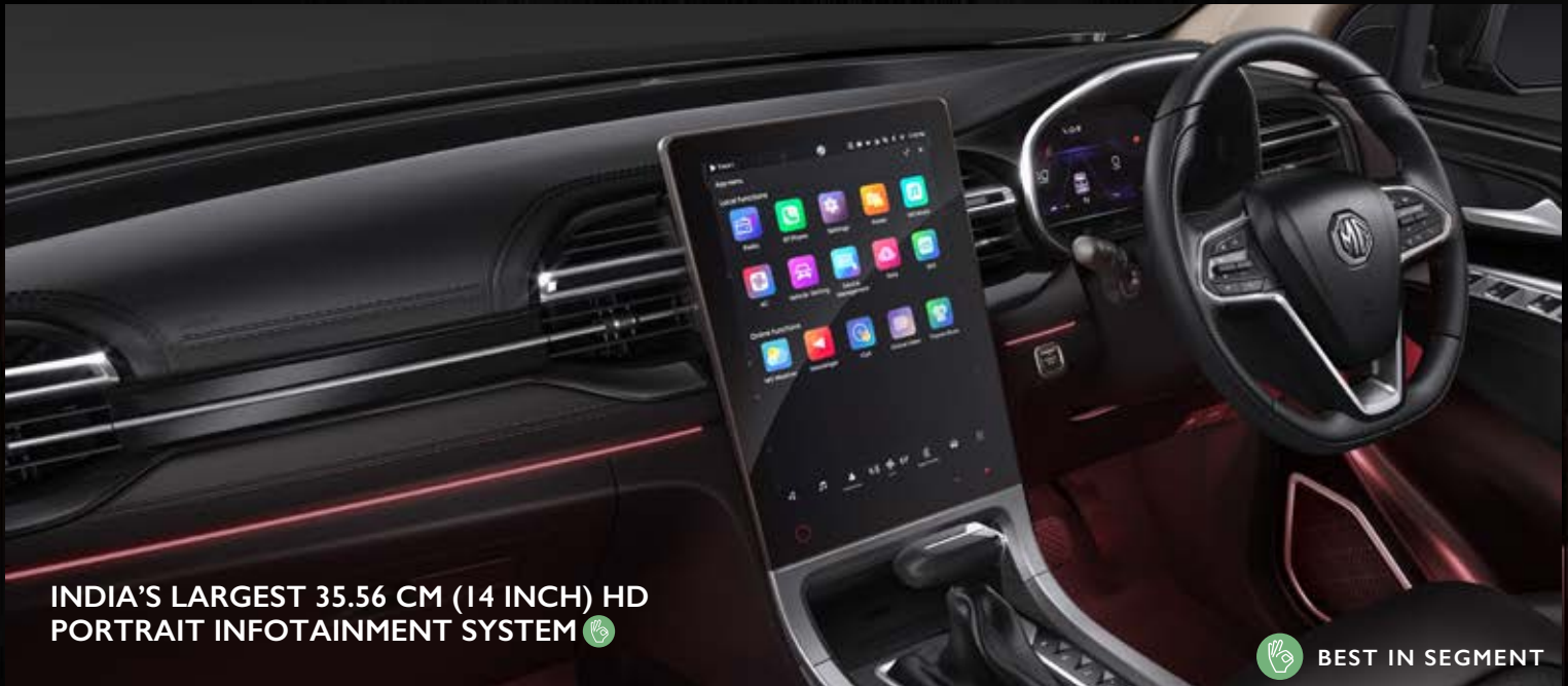
INDIA'S LARGEST 35.56 CM (14 INCH) HD PORTRAIT INFOTAINMENT SYSTEM