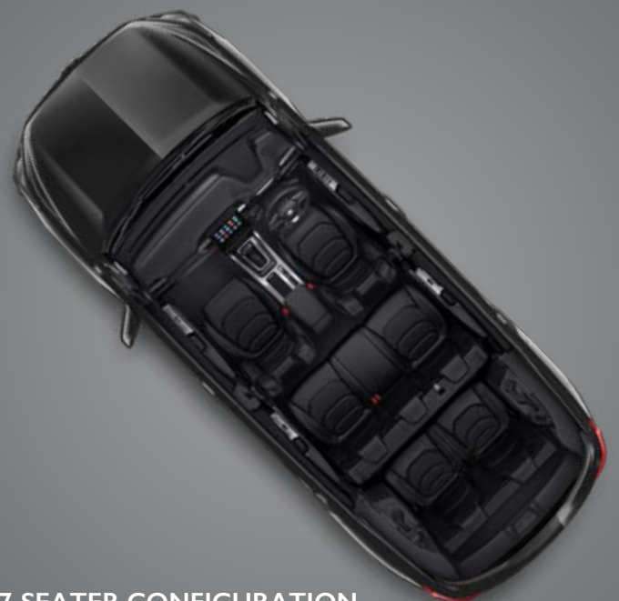
7-SEATER CONFIGURATION WITH CAPTAIN SEATS