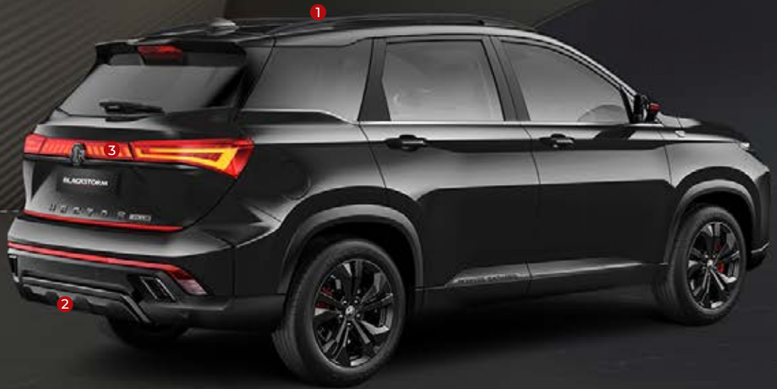
1. PIANO BLACK ROOF RAILS

Prepare to catch attention on the open road with the Hector Blackstorm. The design of its bold front grille and the contours of its rear clusters combine to amplify its powerful character.