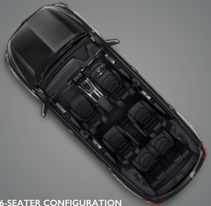
6-SEATER CONFIGURATION WITH CAPTAIN SEATS