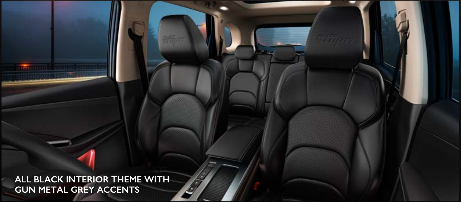
ALL BLACK INTERIOR THEME WITH GUN METAL GREY ACCENTS

Elevate your in-cabin experience to new heights with the Hector Blackstorm. With meticulously crafted opulent Black Theme Interiors and India's Largest 35.56 cm (14 inch) HD Portrait Infotainment System, let every drive be a thrilling experience.