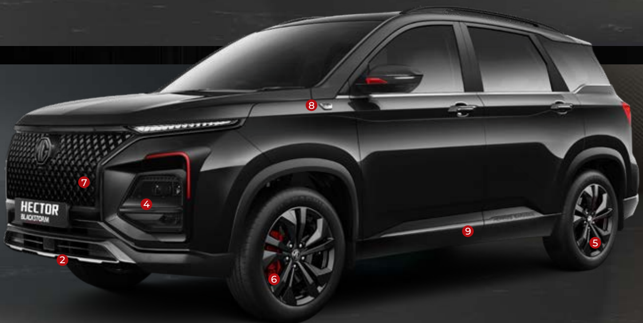
4. LED PROJECTOR HEADLAMPS WITH PIANO BLACK BEZEL