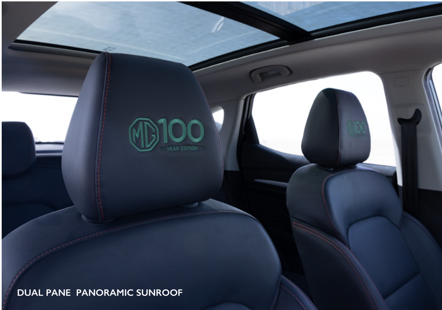
DUAL PANE PANORAMIC SUNROOF