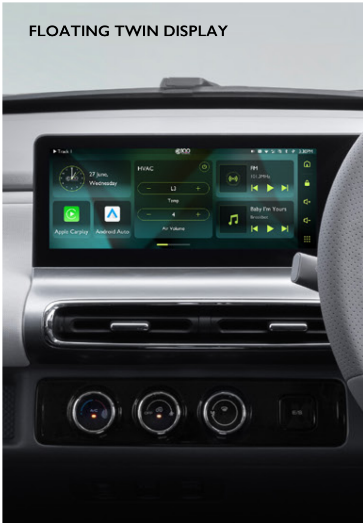
FLOATING TWIN DISPLAY