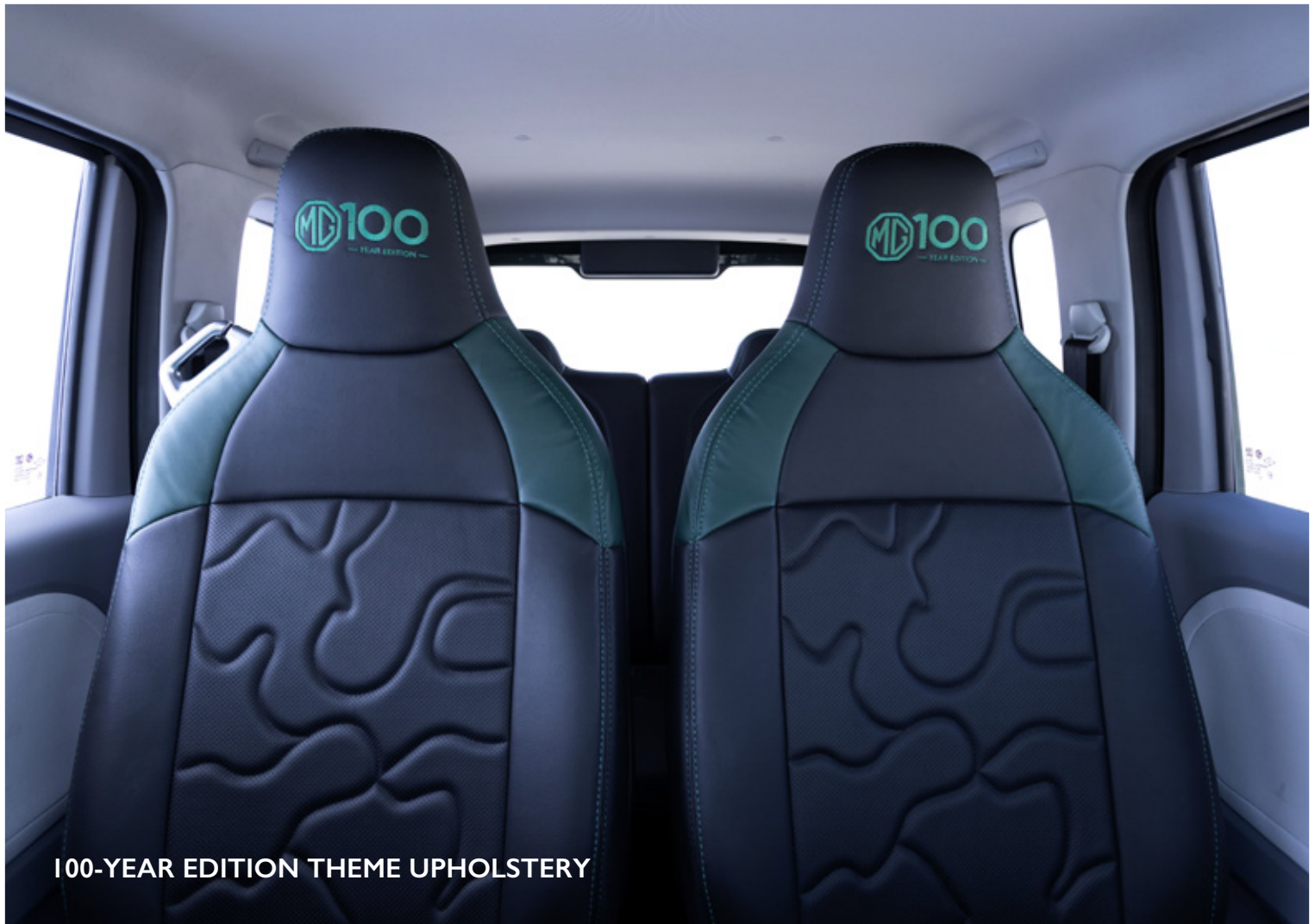
100-YEAR EDITION THEME UPHOLSTERY